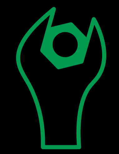
Box Wrench/ Socket Size