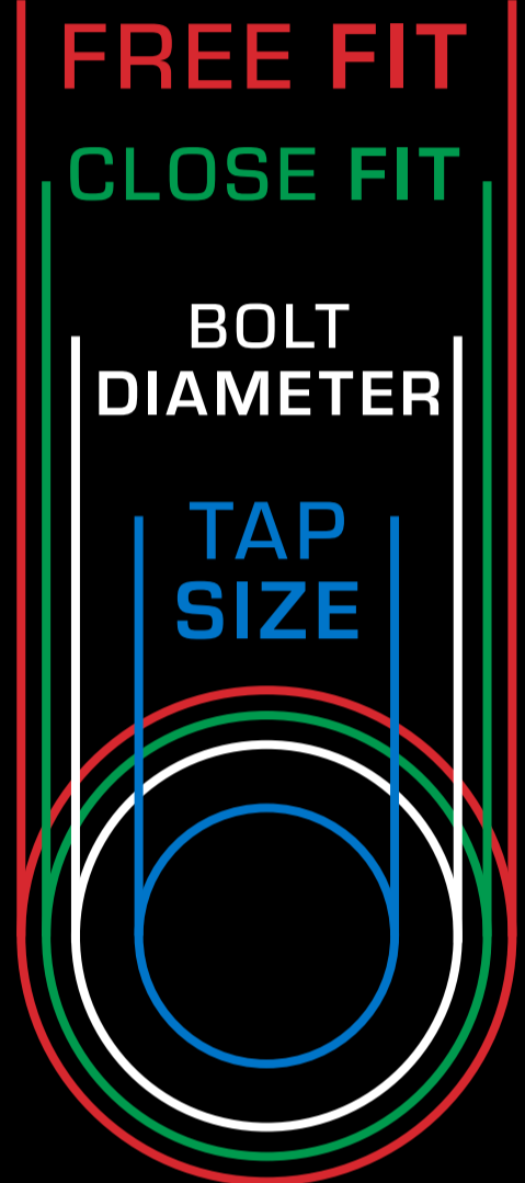
Diagram not to scale.